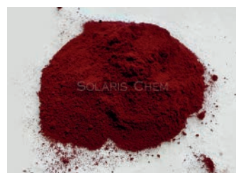
Malonic ester C70 powder