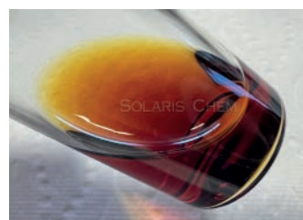
Malonic ester C70 in dimethylcarbonate (DMC)