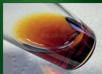
Malonic ester C70 in dimethylcarbonate (DMC)