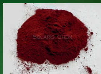
Malonic ester C70 powder